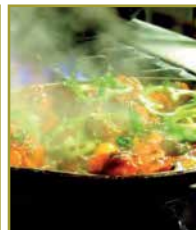
Cinnamon Special Tawa