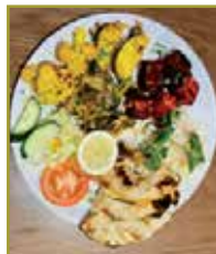
Grilled Salmon Platter

Mouth watering tangy and spicy creation, a popular North Indian dish. Cooked with mango pickle.