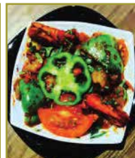
King Prawn Shoondori